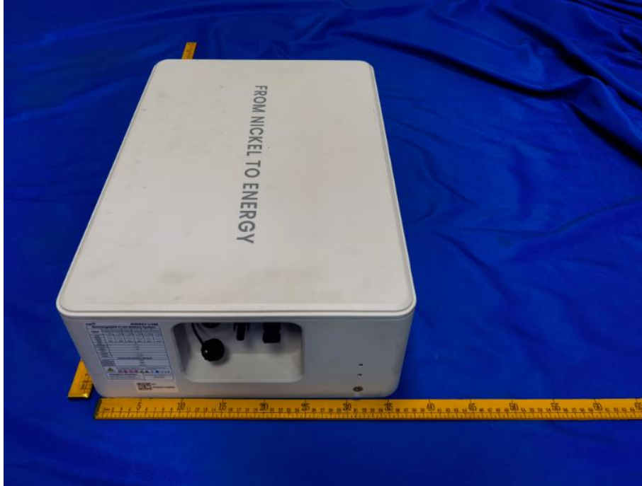
样品图片 (Sample photograph) -6