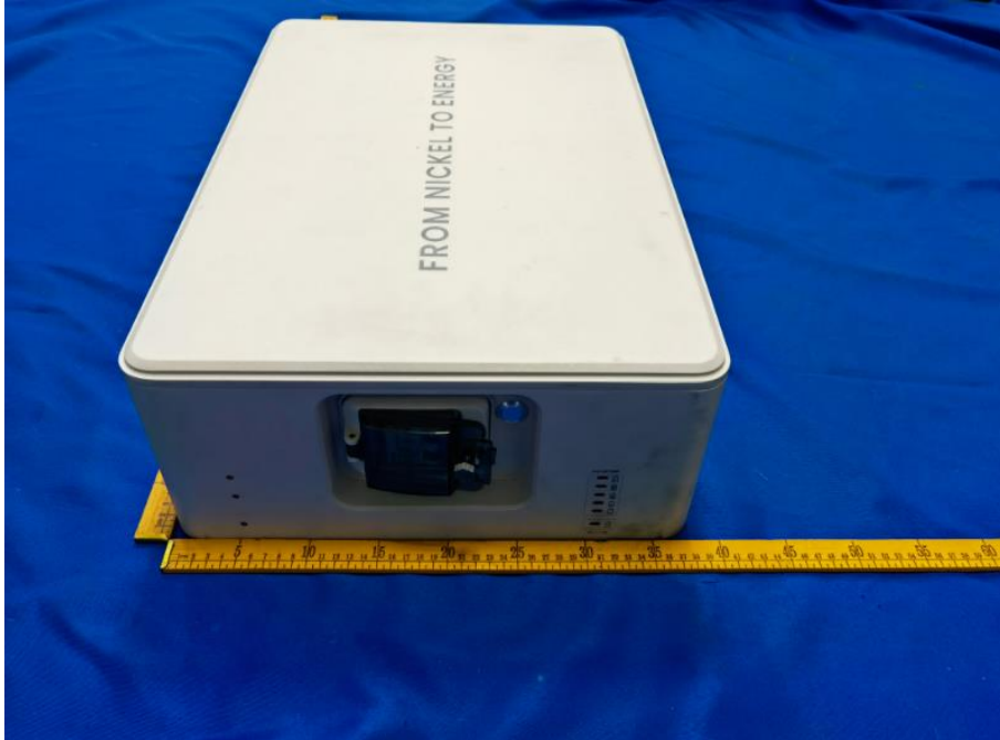
样品图片 (Sample photograph) -4