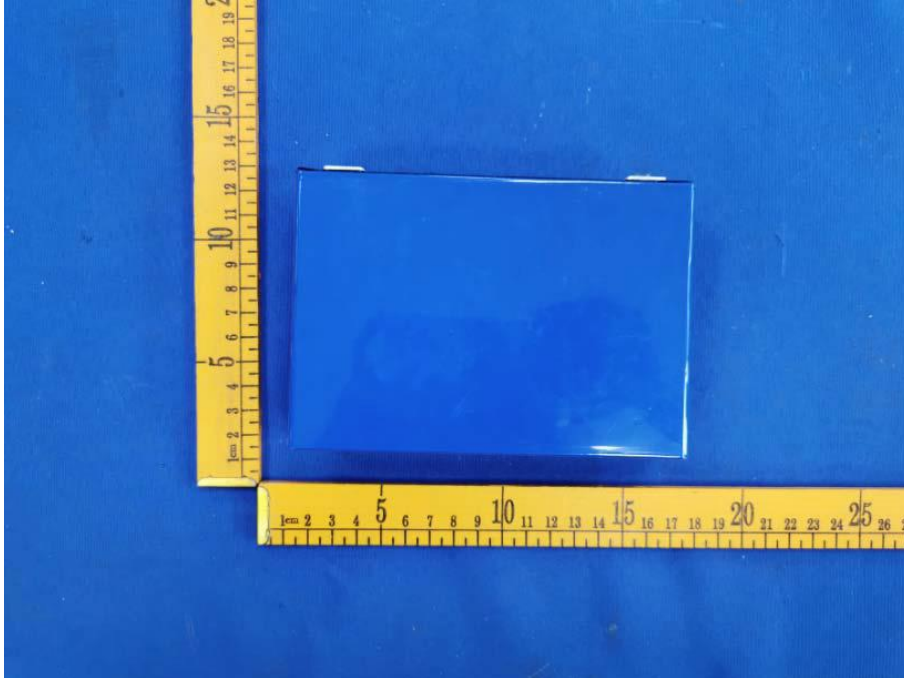
样品图片 (Sample photograph) -10