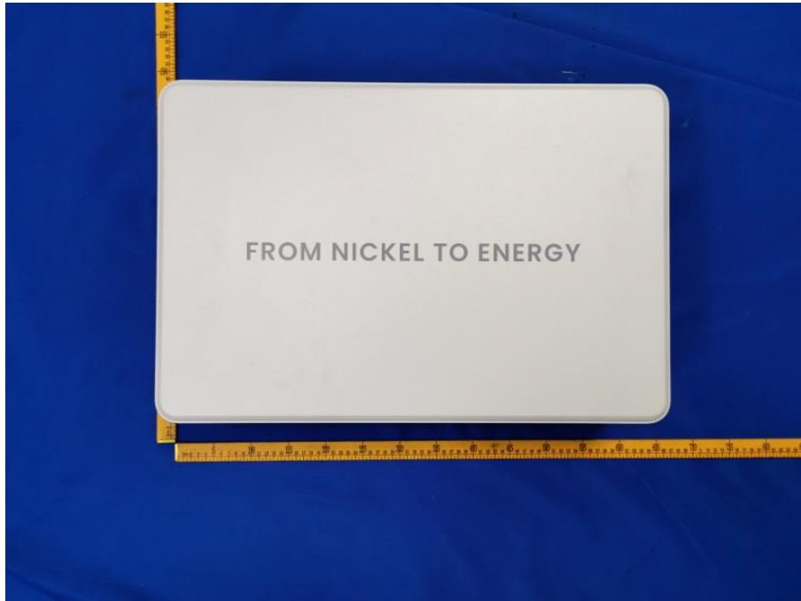
样品图片 (Sample photograph) -2