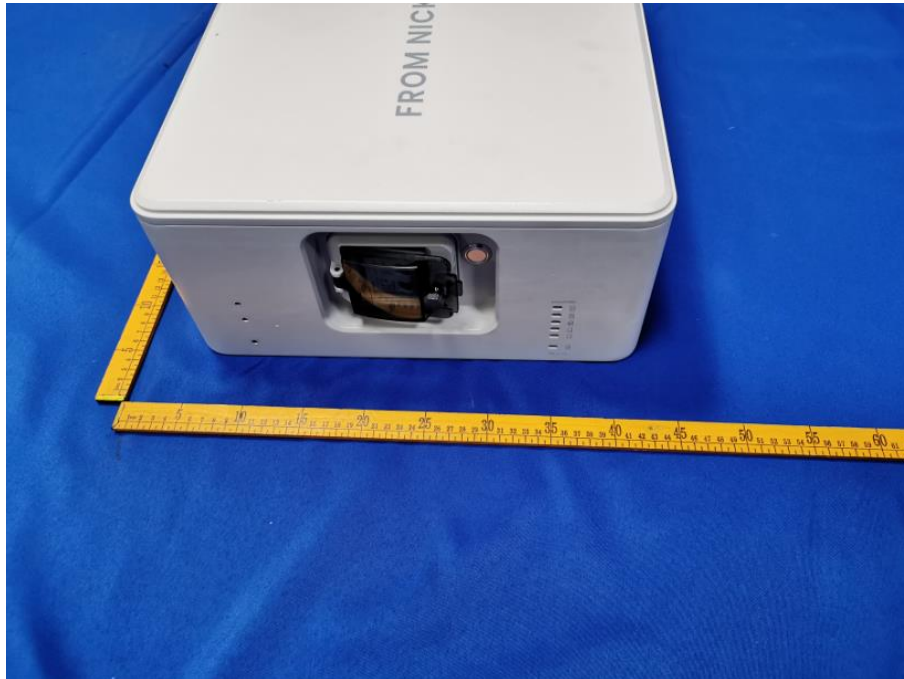
样品图片 (Sample photograph) -4