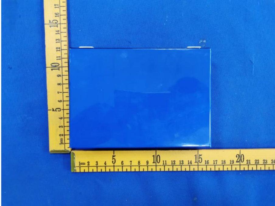
样品图片 (Sample photograph) -10