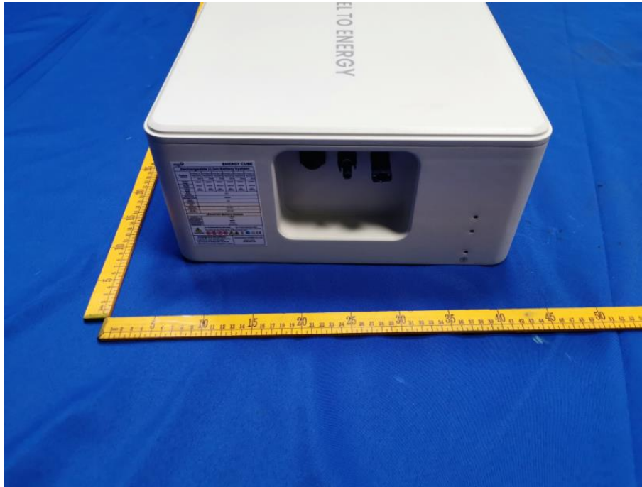
样品图片 (Sample photograph) -6